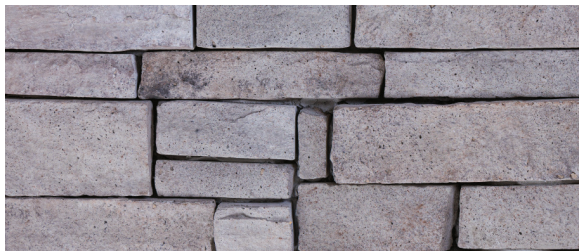
Carolina Ledgestone GA