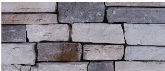
English Bay Tuscan Ledgestone GA