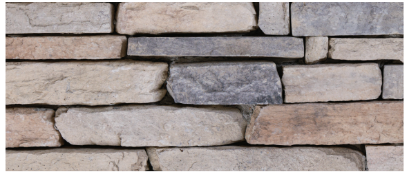
Oleta Tuscan Ledgestone GA