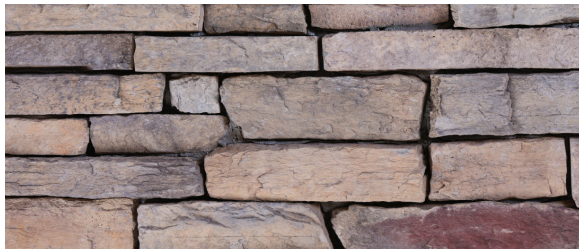
Bucks County Southern Ledgestone GA