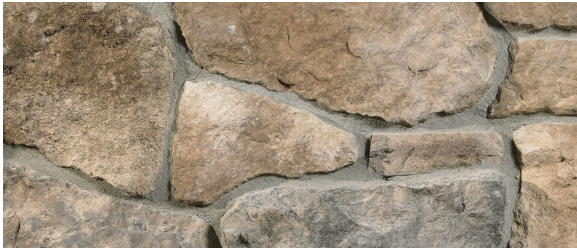
Aspen Fieldstone GA