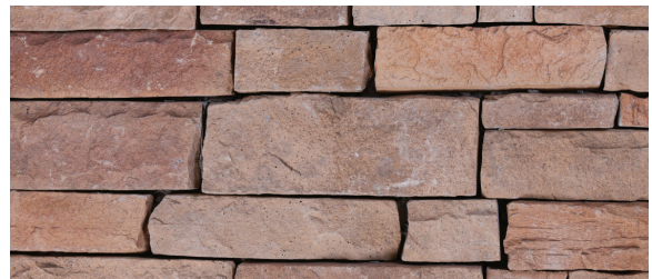
Chardonnay Ledgestone GA