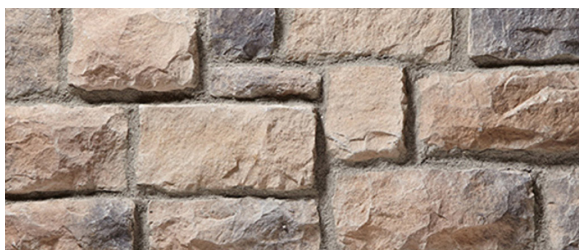
Nantucket Cobble Ledgestone GA