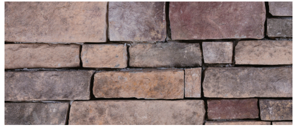
Bucks County Ledgestone GA