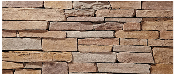
Autumn Southern Ledgestone GA