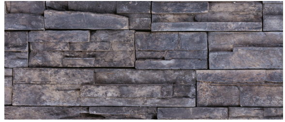
Grey Drift Prostack Lite GA