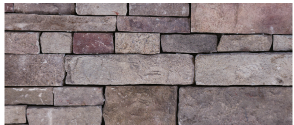
Pennsylvania Ledgestone GA