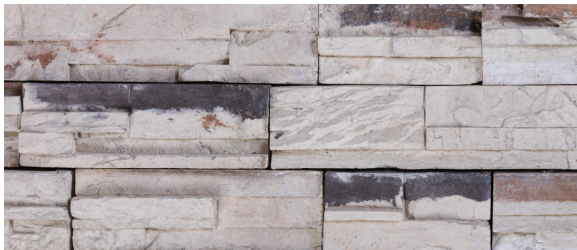
Oleta Prostack Lite GA