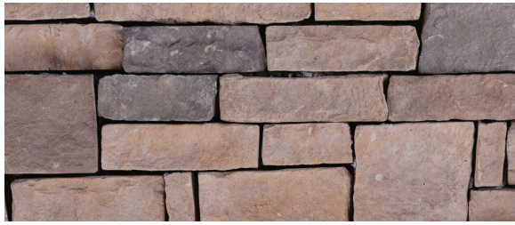
Aspen Ledgestone GA