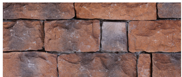
Shadow Oak Cobble Ledgestone GA

Note: Color swatches are for reference only. Physical samples should always be ordered and referenced to ensure the accuracy of the colorway.