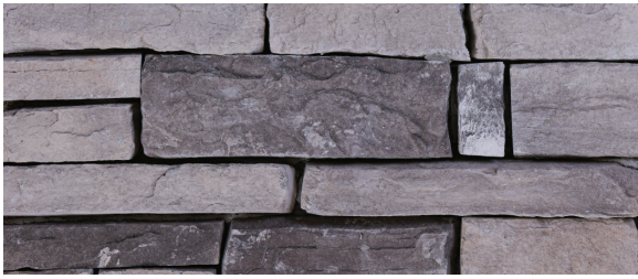
Ocean Fog Tuscan Ledgestone GA