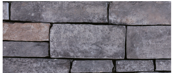
Kentucky Ledgestone GA