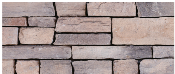
Mist Tuscan Ledgestone GA