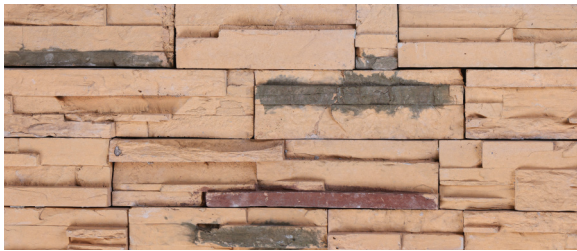
Seasons Prostack Lite GA

This selection guide features a sampling of our most popular offerings. Contact your StoneWorks sales representative for even more stone veneer colors and collections.