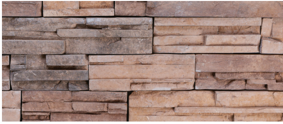
Aspen Prostack Lite GA