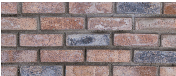
Autumn Blend Clean Brick GA