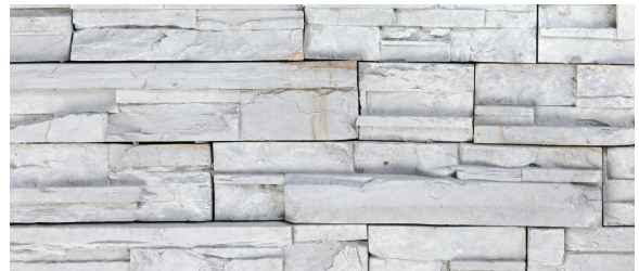
Osceola Prostack Lite GA