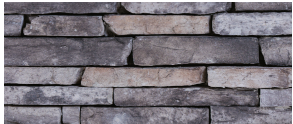
Kentucky Southern Ledgestone GA