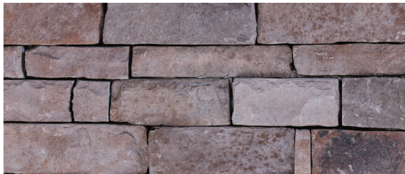
Dakota Ledgestone GA