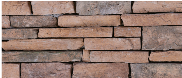
Aspen Southern Ledgestone GA