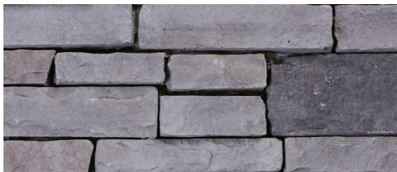
PA Sierra Ledgestone GA