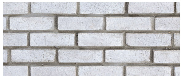
Osceola Clean Brick GA

Note: Color swatches are for reference only. Physical samples should always be ordered and referenced to ensure the accuracy of the colorway.